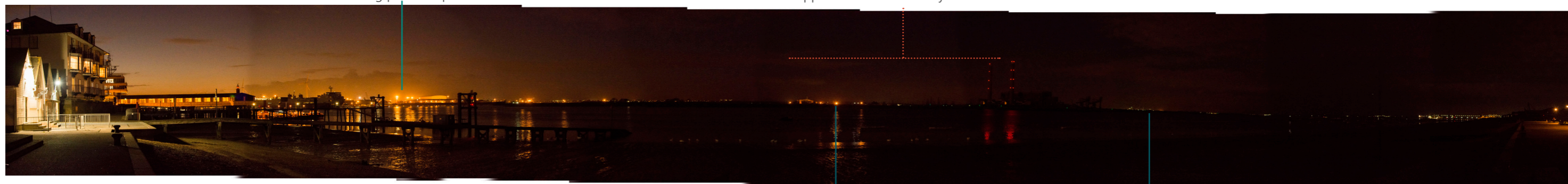
Existing port complex